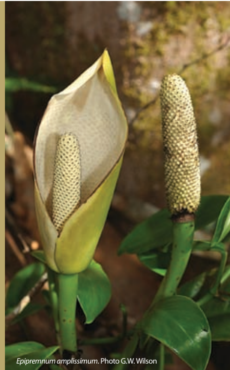
Epipremnum amplissimum .