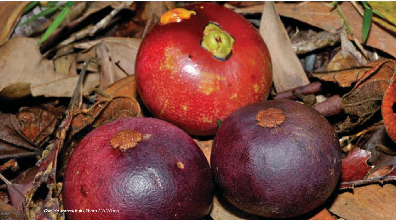
Garcinia warrenii fruits.