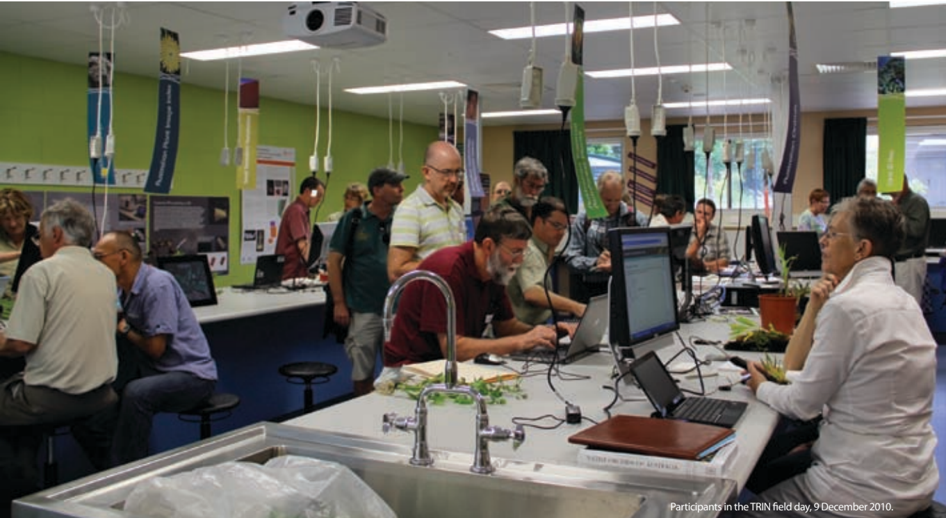
Participants in the TRIN field day, 9 December 2010.