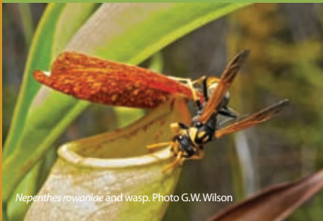
Nepenthes rowaniana and wasp.