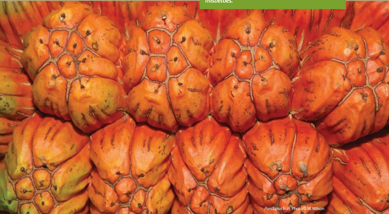
Pandanus fruit.

The RFK Edition 6 Online was launched in December 2010, including over 2500 species of trees, shrubs, vines, herbs, palms, pandans, epiphytes and mistletoes.