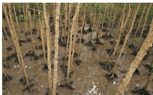
Mangrove forest.

During 2010 ATH charged external clients $35,247 in fees. This included data provision fees ($30,000), collecting service fees ($1,530), herbarium access fees ($2,080), specimen identification service fees ($540) and advisory board sitting fees ($1,097). In addition, $8,600 was levied by ATH as overheads on research grants.