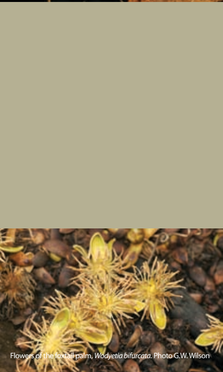
Flowers of the foxtail palm, Wodyetia bifurcata .