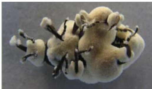
Weevil colonised by the fungus Beauveria bassiana

with medicinal applications (e.g. cyclosporin), as well as possible biocontrol agents (e.g. Metarhizium anisopliae ).